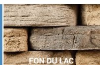
FON DU LAC