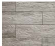
Timber Wolf Grey