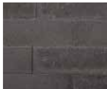
Ebony - Untumbled