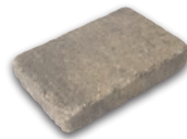
210 x 315 x 60 mm 8.27 x 12.40 x 2.36 in