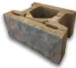
Standard 203 x 457 x 305 mm 8 x 18 x 12 in