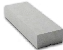
Coping 178 x 1000 x 350 7 x 39.37 x 13.78