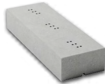
Standard 178 x 1000 x 350 7 x 39.37 x 13.78